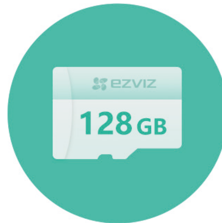
Supports MicroSD Card

(*256 GB capacity card supported. Please update to the latest firmware version via the EZVIZ App to get the support. Cloud storage service is only available in certain markets. Please verify the availability before making any purchase.)