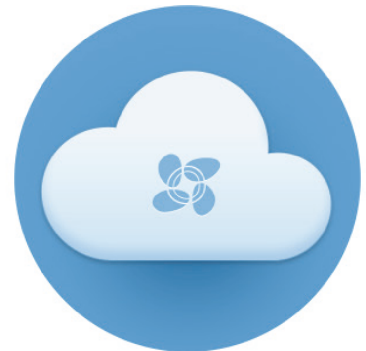
Encrypted Cloud Storage